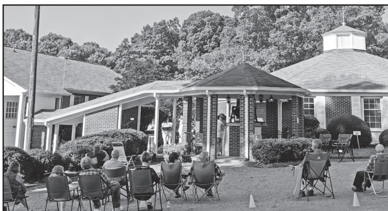
Union UMC, Waxhaw - Outdoor Worship