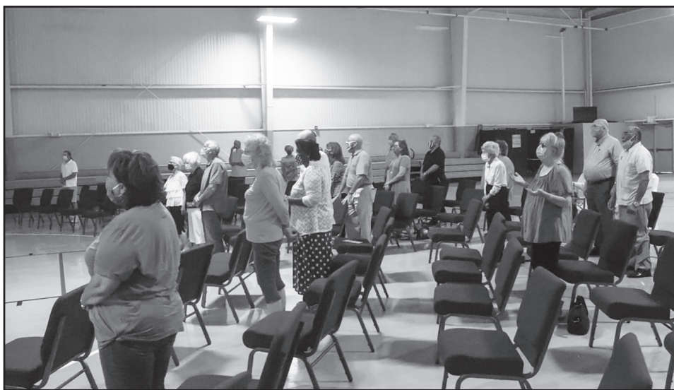
Above: Pleasant Grove, Charlotte - Socially-Distant and Masked Indoor Worship - Left: Muir's Chapel, Greensboro - Blood Drive