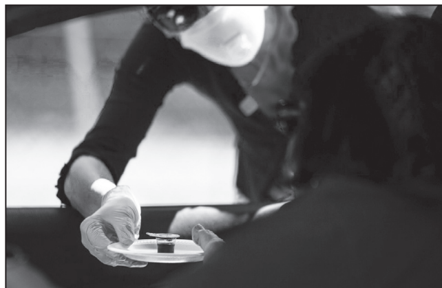
Light of Christ UMC, Charlotte - Drive-Thru Communion - photo by Lindsay Kappius