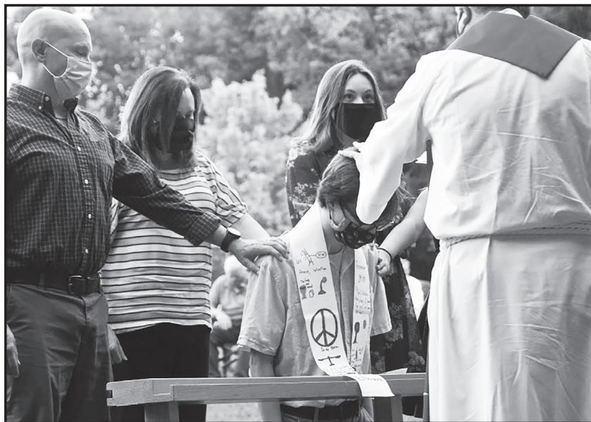
Guilford College UMC - Outdoor Confirmation Service