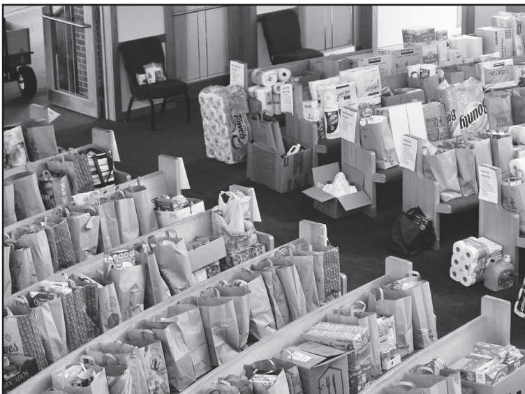
Above: Guilford College UMC - Fill the Pews: if not with people, with donations